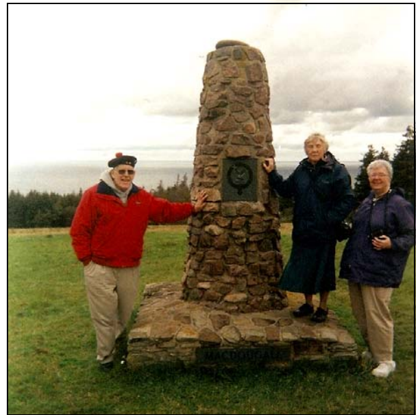
MacDougall Monument Cape Breton Island Canada

In Scotland these entertainments are usually called Burns Suppers, but in other countries Burns Night is